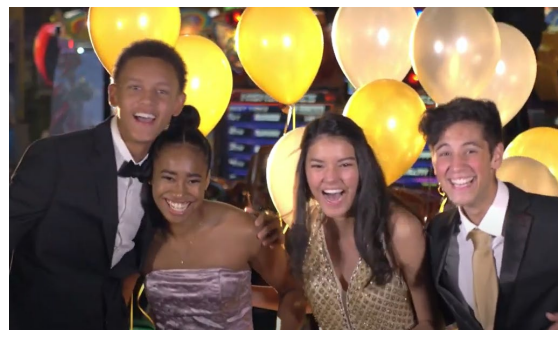
I'm Supposed to be in School