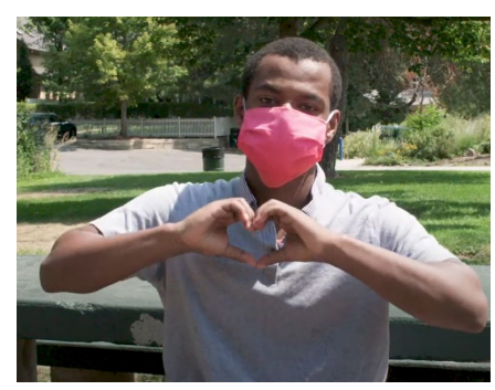
Behind the Mask